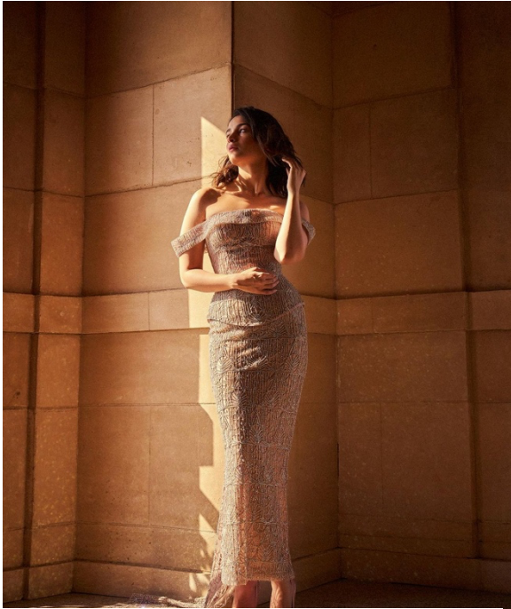
British actress Alia Bhatt in a Rami Kadi couture sand shell embroidered set from the “Film Noir” collection.