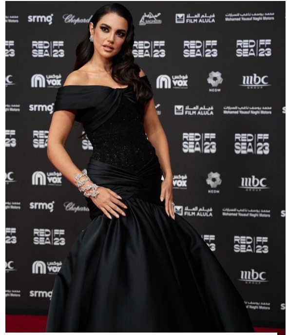
Tunisian actress Dorra Zarrouk in a custom-made Rami Kadi couture off-shoulder black gown embroidered with crystals and beads forming a linear pattern.

Red Sea jury member and Indian actress Freida Pinto dazzled in two distinct looks – one from the 'Film Noir' collection and another from the 'Mantra' collection – during the 'Women in Cinema' gala at the Red Sea Film Festival, showcasing the versatility of Maison Rami Kadi's designs.