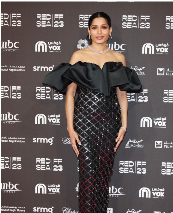
Freida Pinto in a black Rami Kadi silver sequined Film Noir couture gown with thread fringes and a puffy satin neckline.

Red Sea jury member and Indian actress Freida Pinto dazzled in two distinct looks – one from the 'Film Noir' collection and another from the 'Mantra' collection – during the 'Women in Cinema' gala at the Red Sea Film Festival, showcasing the versatility of Maison Rami Kadi's designs.