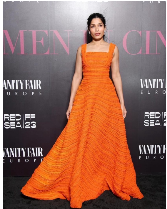
Freida Pinto in a hand-embroidered sunset orange gown adorned with ruffles of tulle , organza leaves, and silenes from the “Le Reveil” collection.